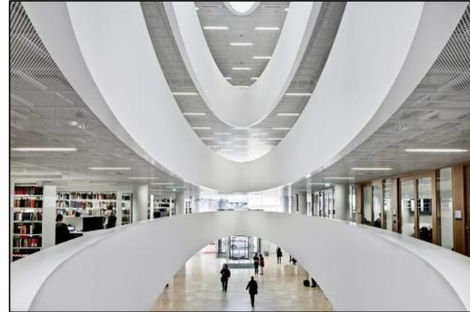
The role of the leadership