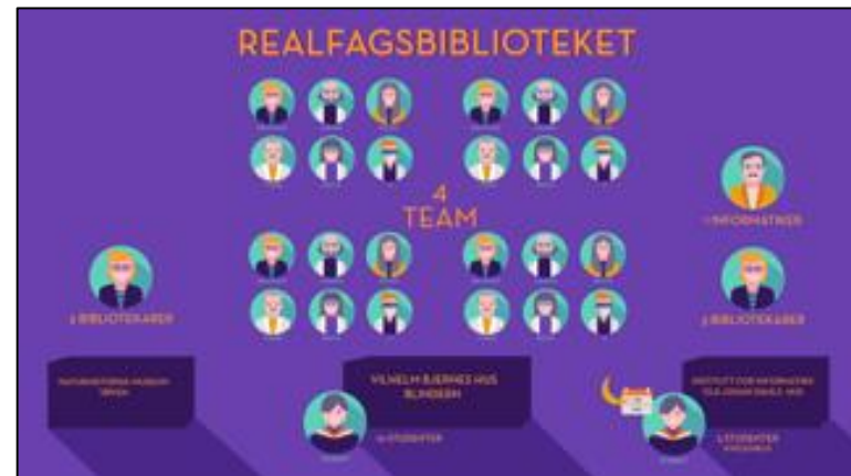
A cultural change?