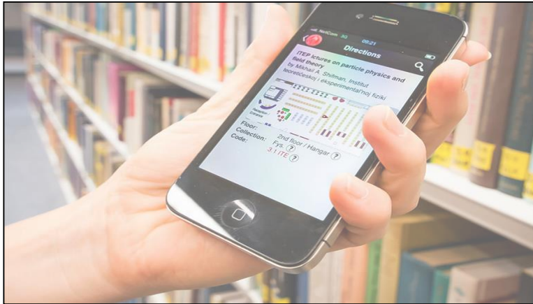
A bumpy road